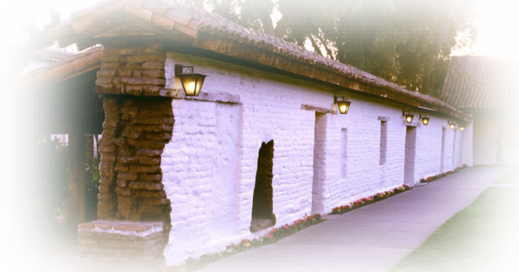
Photo documentation by CSS on Thursday, Saturday, and Sunday mornings